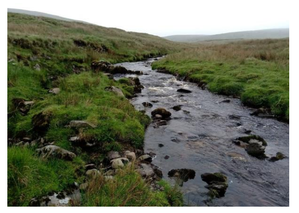
Photo Insert 8.2: Photographs of the Crook Burn from the lower (left) and upper (right) catchment areas