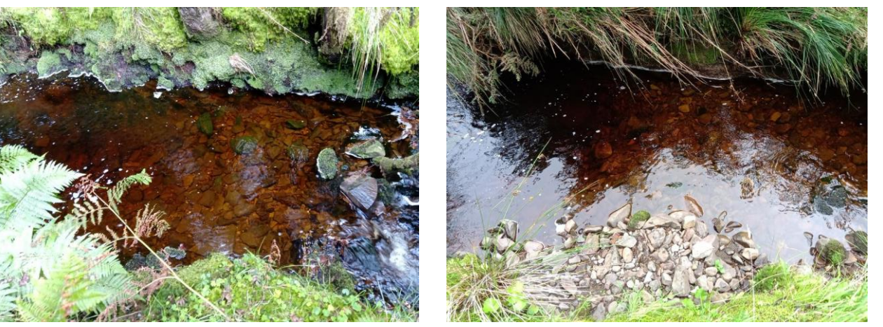
Examples of stream discolouration identified during the hydrology surveys in Photo Insert 8.5: August 2020