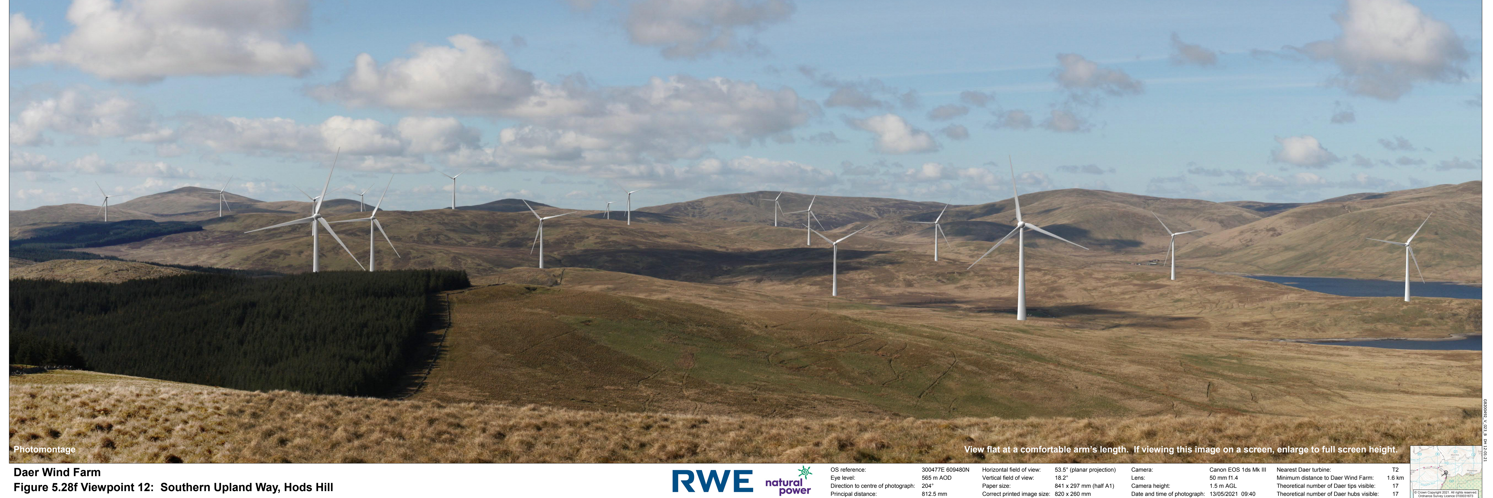
Figure 5.28f Viewpoint 12: Southern Upland Way, Hods Hill