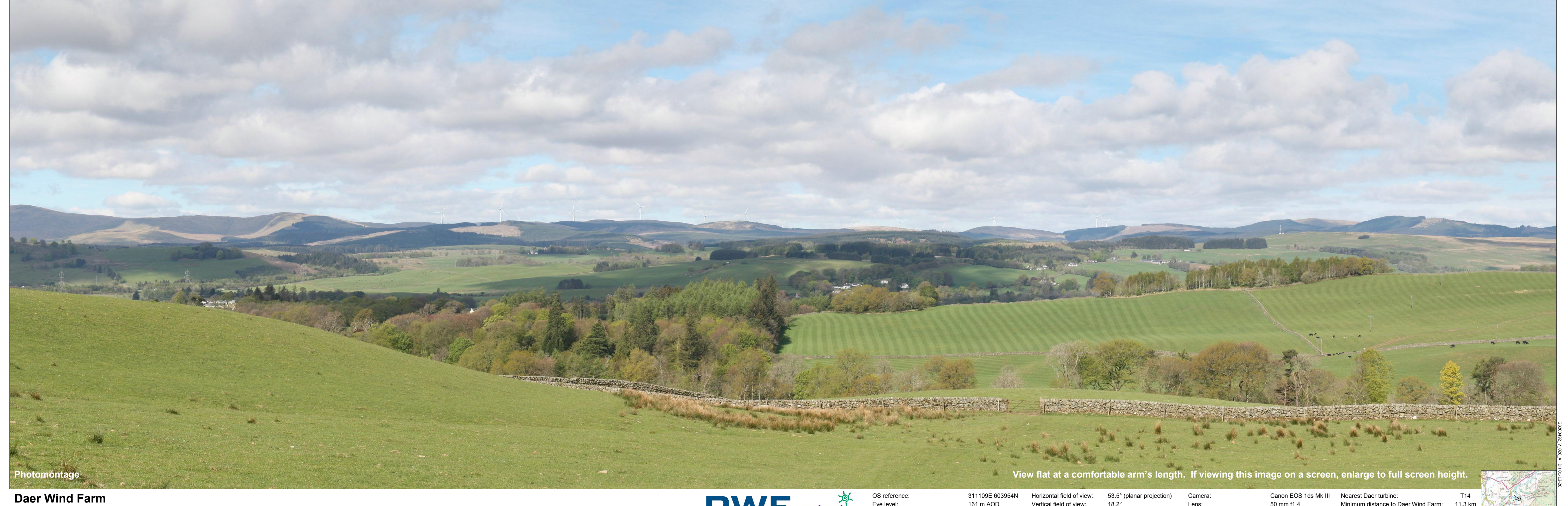
Figure 5.31f Viewpoint 15: Southern Upland Way/Romans & Reivers Route near Craig Fell