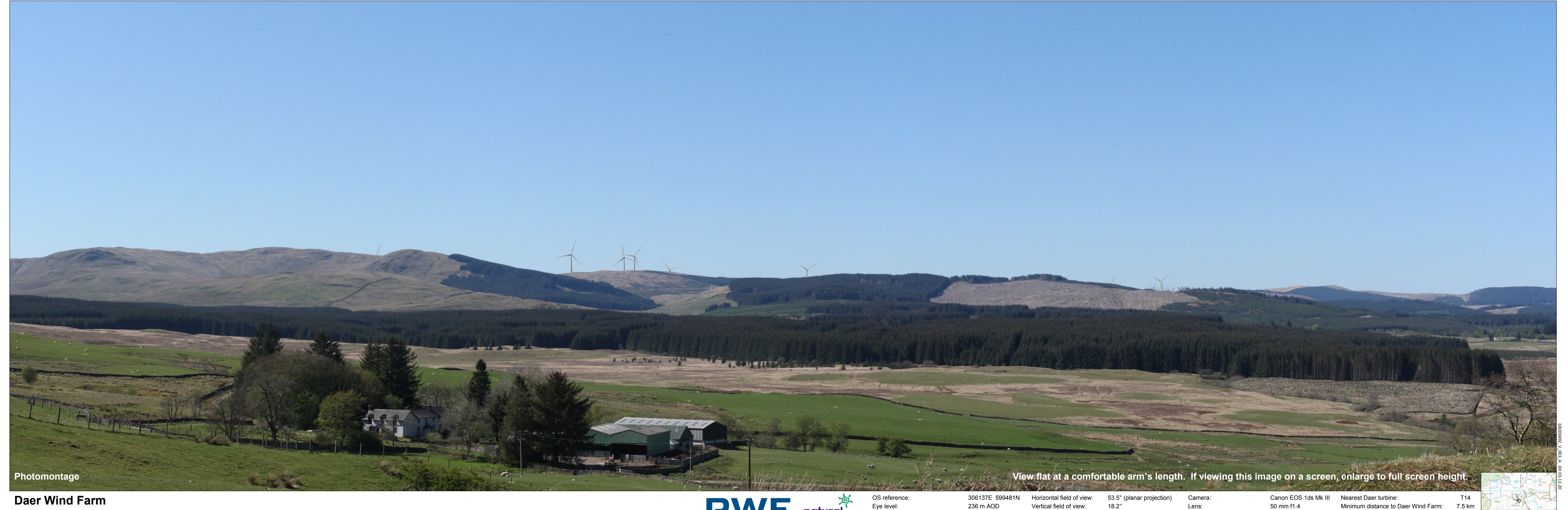
Figure 9.7f Cultural Heritage Viewpoint 3: Stidriggs