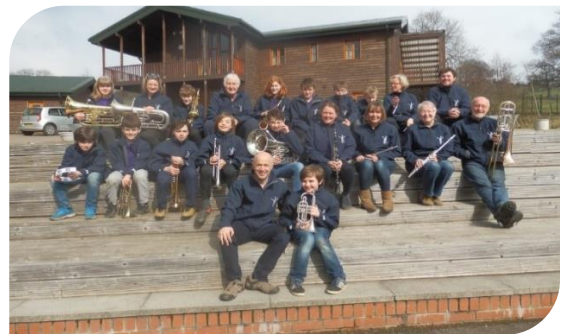
Residential April 2018