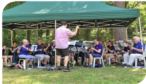
Woodfest Chopwell Woods July 2018