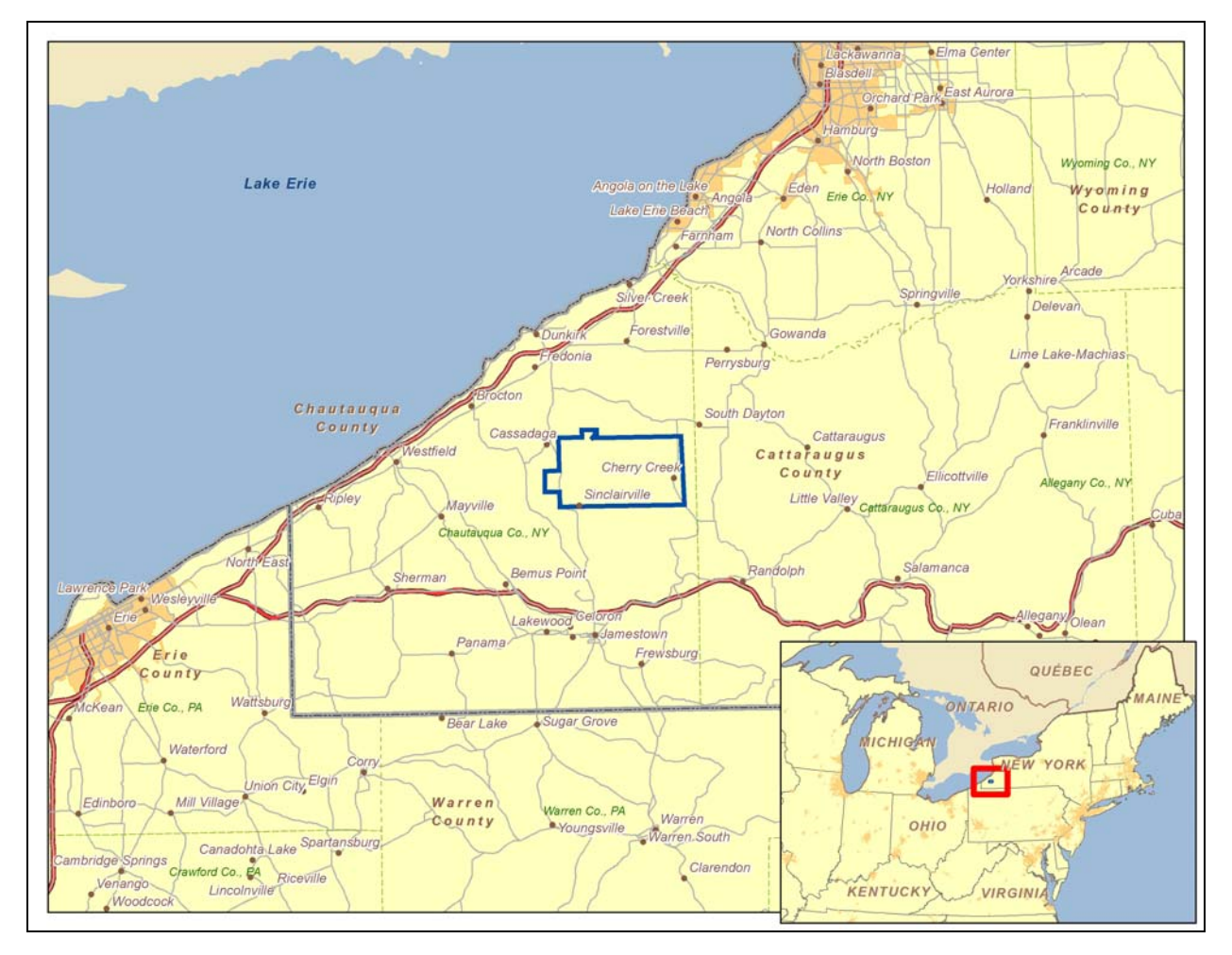
Figure 1: Wind Farm Project Area and Local Communities

The proposed wind energy project area and local communities are depicted in Figure 1, below.