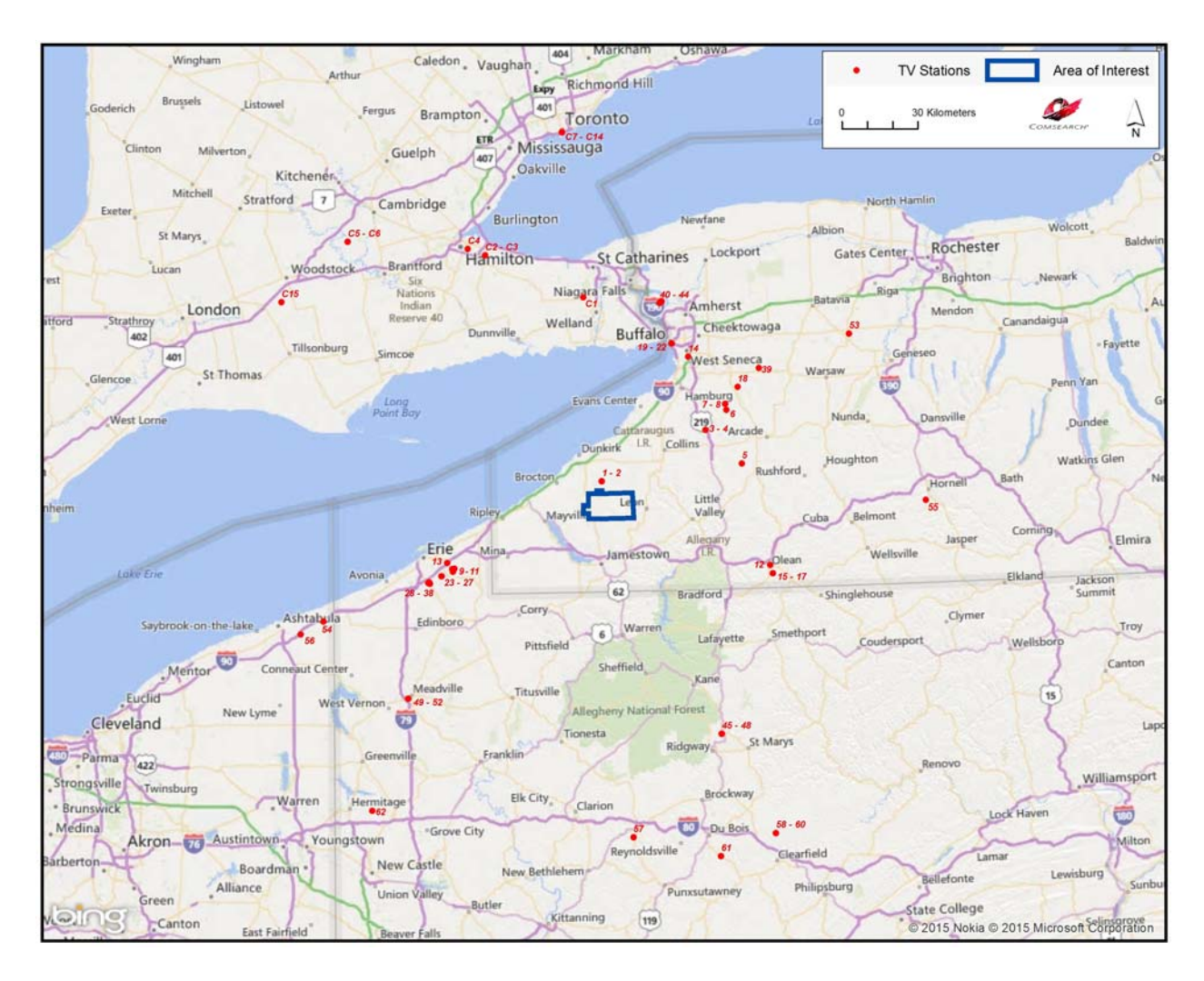
Figure 2: Plot of Off-Air TV Stations within 150 Kilometers of Project Area

To begin the analysis, Comsearch compiled all off-air television stations<sup>1</sup> within 150 kilometers of the center of the project area of interest (AOI). Appendix A contains a tabular summary of these stations. A plot depicting their locations appears in Figure 2, below.